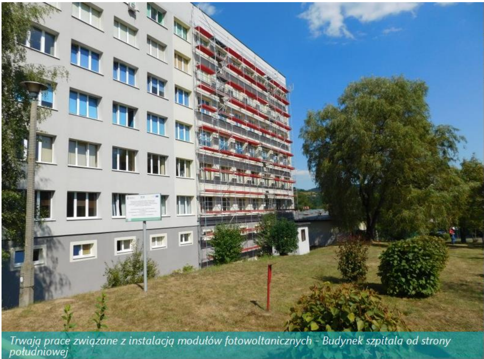
Trwają prace związane z instalacją modułów fotowoltanicznych - Budynek szpitala od strony południowej

http://www.zozsuchabeskidzka.pl/Aktualno%C5%9Bci/1850-Projekt_EcoQuiup_-_budowa_instalacji_fotowoltanicznej_na_budynku_Szpitala.html